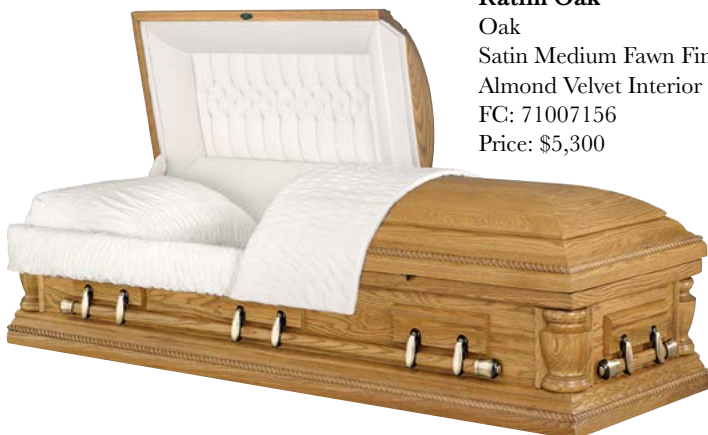
Ratlin Oak Oak Satin Medium Fawn Finish Almond Velvet Interior FC: 71007156 Price: $5,300