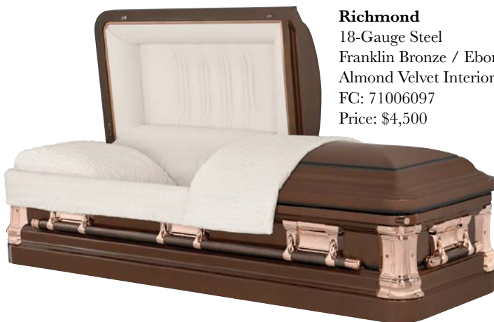
Richmond 18-Gauge Steel Franklin Bronze / Ebony Finish Almond Velvet Interior FC: 71006097 Price: $4,500