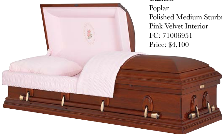
Cameo Poplar Polished Medium Sturbridge Finish Pink Velvet Interior FC: 71006951 Price: $4,100