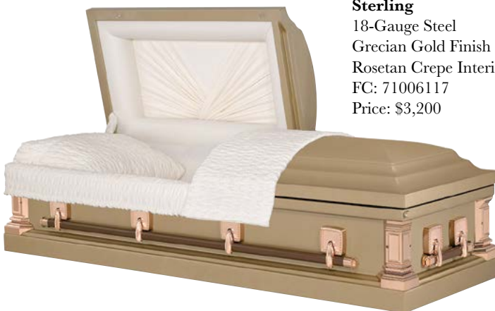
Sterling 18-Gauge Steel Grecian Gold Finish Rosetan Crepe Interior FC: 71006117 Price: $3,200