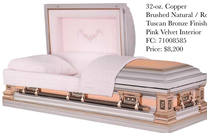
Victoria 32-oz. Copper Brushed Natural / Rosebud / Tuscan Bronze Finish Pink Velvet Interior FC: 71008585 Price: $8,200