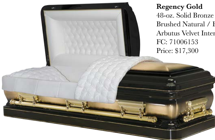
Regency Gold 48-oz. Solid Bronze Brushed Natural / Ebony Finish Arbutus Velvet Interior FC: 71006153 Price: $17,300