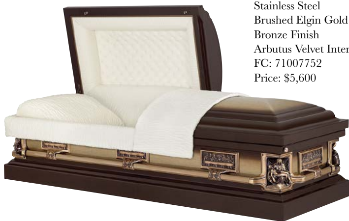
Pieta Stainless Steel Brushed Elgin Gold / Metallic Bronze Finish Arbutus Velvet Interior FC: 71007752 Price: $5,600