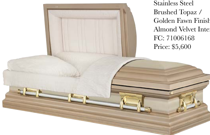
Newport Stainless Steel Brushed Topaz / Golden Fawn Finish Almond Velvet Interior FC: 71006168 Price: $5,600