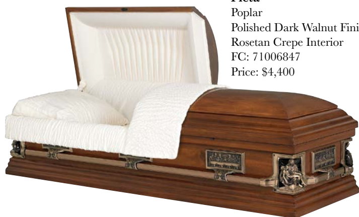
Pieta Poplar Polished Dark Walnut Finish Rosetan Crepe Interior FC: 71006847 Price: $4,400