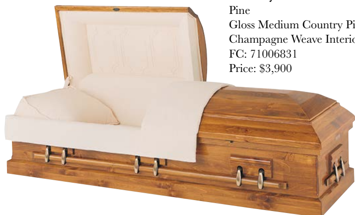
Country Pine Pine Gloss Medium Country Pine Finish Champagne Weave Interior FC: 71006831 Price: $3,900