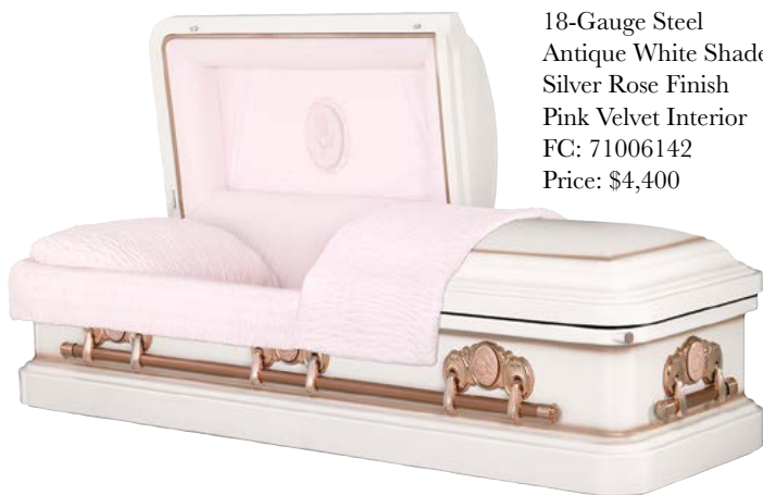
Cameo Rose 18-Gauge Steel Antique White Shaded Silver Rose Finish Pink Velvet Interior FC: 71006142 Price: $4,400